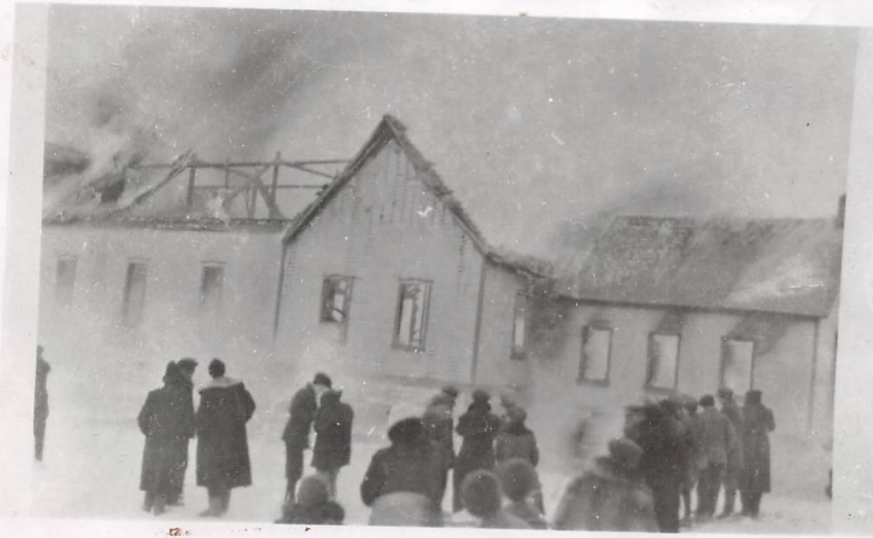
The meeting house burned down about 1911. It was situated where the Social Centre now stands.