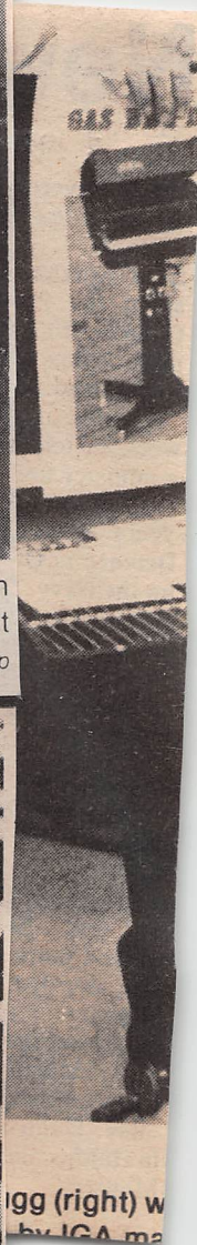
igg (right) w by IGA ma